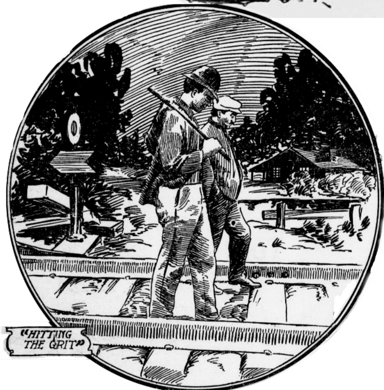
Illustrations of hobo life printed in late-19 th century American newspapers